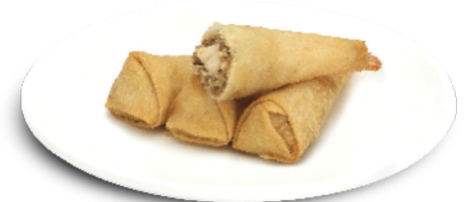
Spring Roll Shrimp Tail