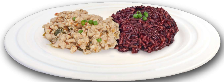
Riceberry Rice with Pork Larb