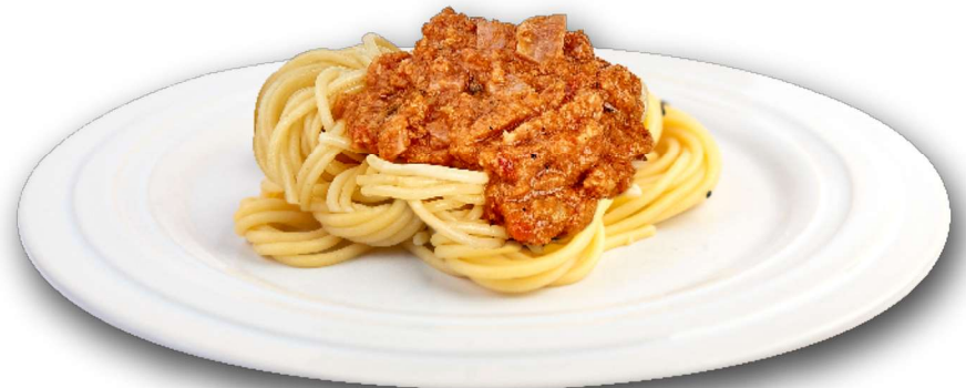
Spaghetti with Red Sauce