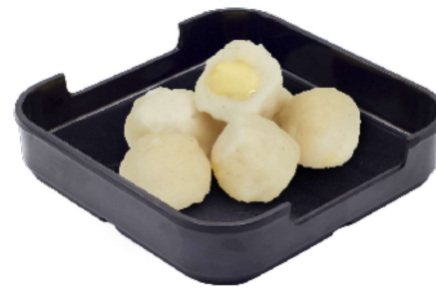
Cheese Ball Fish