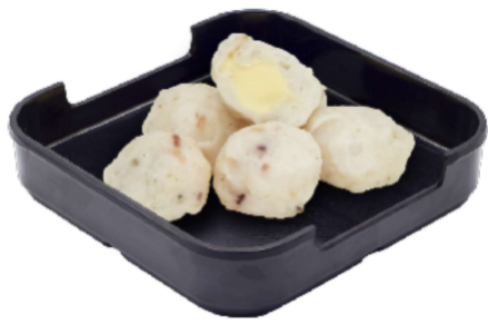
Cheese Ball Cuttlefish