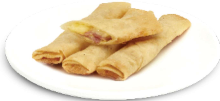
Ham Cheese Spring Roll