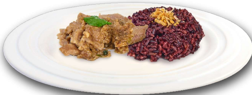
Riceberry Rice with Stir Fried Garlic and Pork