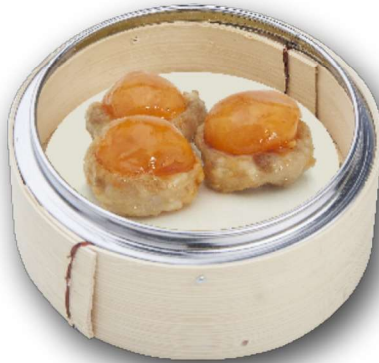
Imperial Salted Egg Pork Dumpling