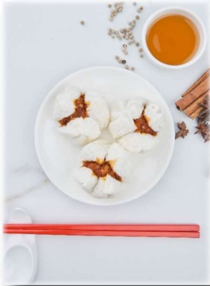
BBQ Pork Bun