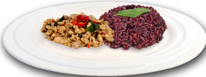
Riceberry Rice with Stir-Fried Basil Minced Prok