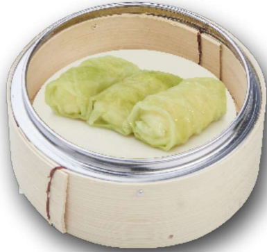
Shrimp Cabbage Roll