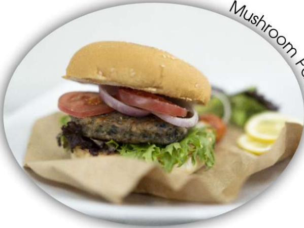
Mushroom Patty Burger