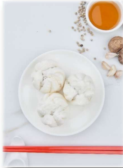
Minced Pork Bun