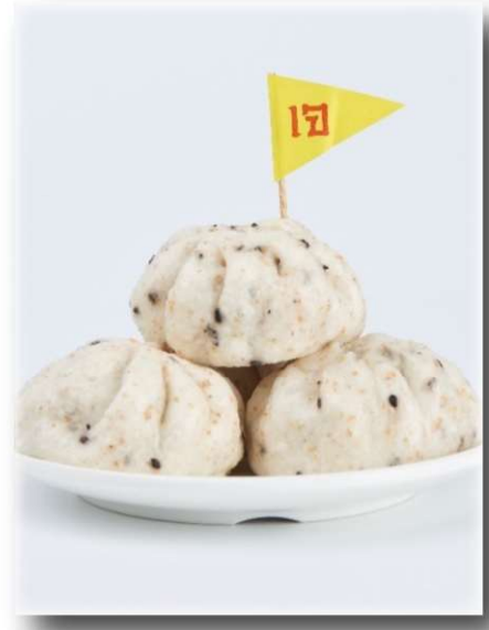
Wholewheat vegetable Bun