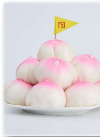
Sweet Mung Bean Bun