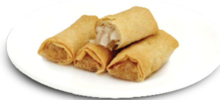
Vegetable Spring Roll