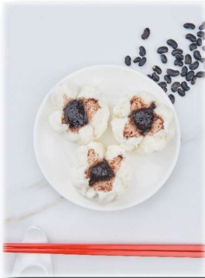
Sweet Black Bean Bun