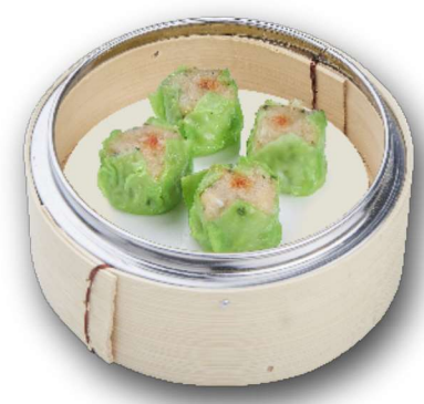
Jade Pork Shaomai