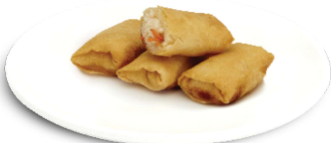
Fried Shrimp Spring Roll