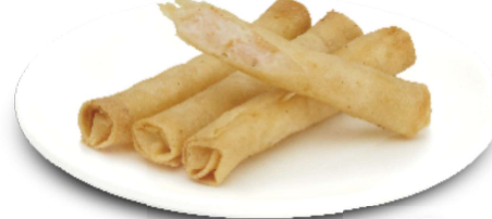
Shrimp Stick Roll