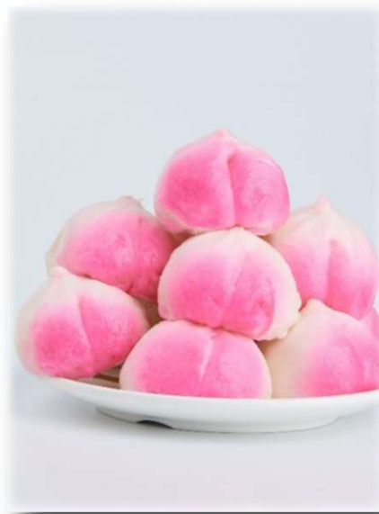
Auspicious Custard Bun