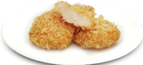
Fried Shrimp Cake