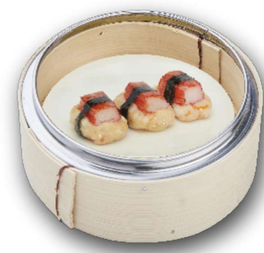
Imitation Crab with seaweed wrapped