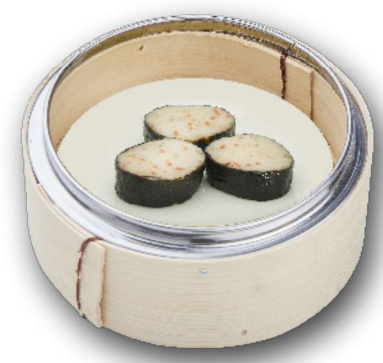
Stuffed Shrimp with Seaweed