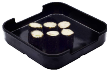
Seaweed Wrapped Pork Rolls