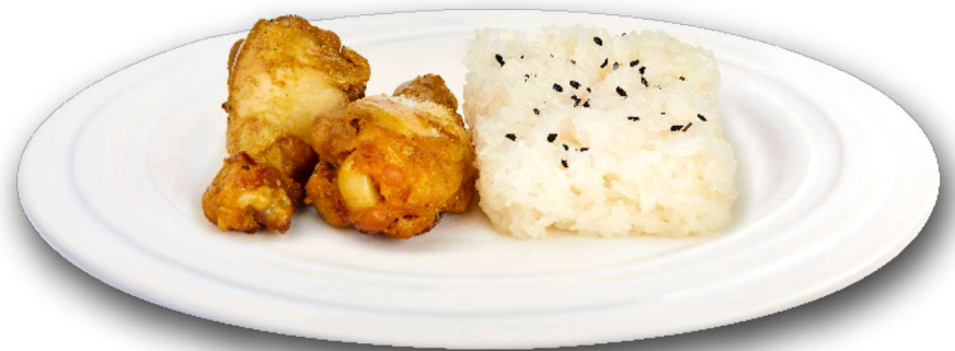
Grilled Coconut Milk Chicken with Sticky Rice